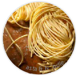
Pasta & noodles